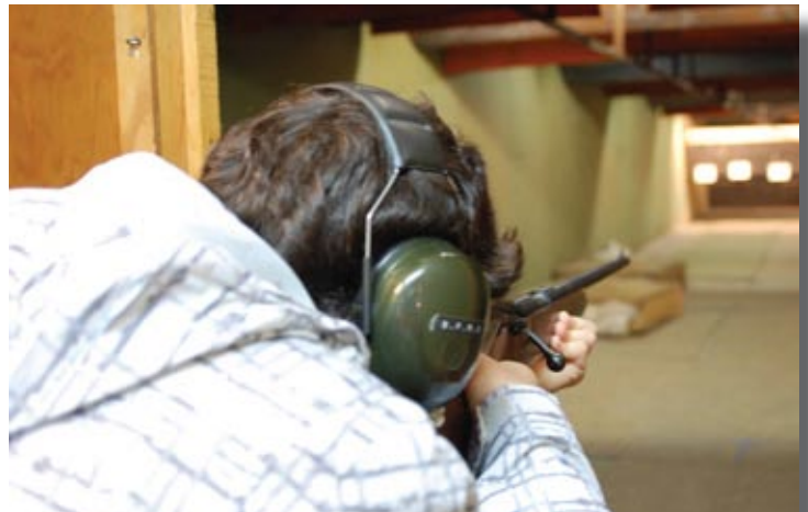
Children from the shooting program. Will continue till April.